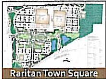
Raritan Town Square

Menlo Engineering congratulates Garden Commercial Properties on the successful Raritan Town Square project. We are also Proud to be the Site Engineer/Landscape Architect for Garden Commercial Properties.